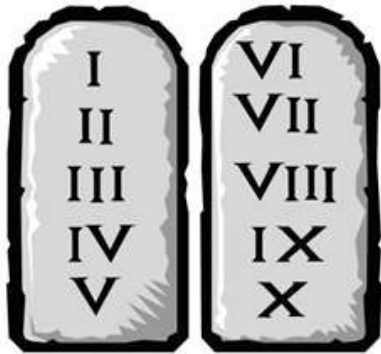
The Ten Commandments